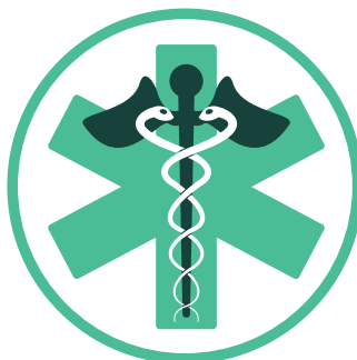
Hospital and Emergency Room Services and Many More Health Services

Find participating medical providers on the Kentucky Department for Medicaid Services website at prdweb.chfs.ky.gov/ProviderDirectory/PDSearch.aspx , or call 1-800-635-2570