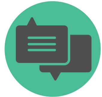
Behavioral Health Therapy and Counseling