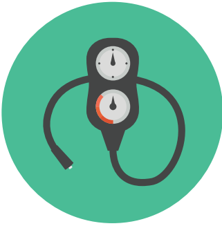
Blood Sugar and Blood Pressure Screenings