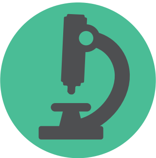
Infectious Disease Screening