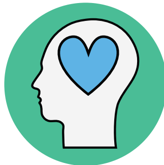
Substance Use Disorder and Opioid Use Disorder Treatment